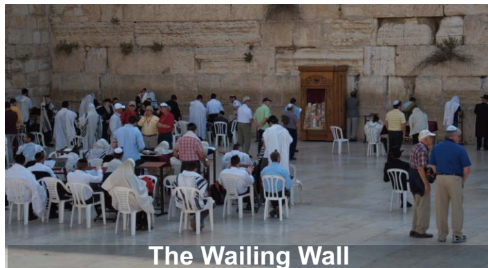
The Wailing Wall

Today's first stop is Caesarea, a center of the early Christians where an angel visited Cornelius, the first Gentile believer (Acts 10), and where Paul was imprisoned for two years before appealing to Caesar. Look out over the Valley of Jezreel from the heights of Mount Carmel, where Elijah defeated the prophets of Baal (1 Kings 18). Travel inland to Nazareth, the childhood home of Jesus. Visit Ein Harod, the spring where Gideon gathered his men to fight the Midianites (Judges 7:1). Look out over the Sea of Galilee from mount Arbel, before checking into your Galilee hotel for dinner and overnight.