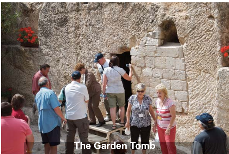
The Garden Tomb