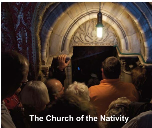
The Church of the Nativity

Visit the Baptismal Site at Kasr el Yehud, where many believe that Jesus was baptized by John the Baptist (John 1). Look out over the Valley of the Shadow as you pass through the Judean Wilderness on the way to Jerusalem. End your day with a group picture taken from the Mount of Olives, where Jesus ascended into heaven (Acts 1:9-12). Check into your Jerusalem hotel for dinner and overnight.