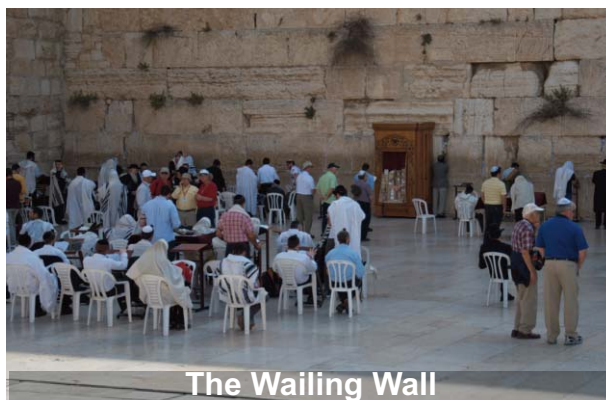
The Wailing Wall

Walk the Temple Mount (conditions permitting). Explore ancient Jerusalem at the Western Wall. View the Pool of Bethesda where Jesus performed the Sabbath miracle (John 5:1-31). Sing a hymn in the Church of St. Anne and experience its rich acoustics. See the Lithostratos in Herod's Antonia Fortress, where Jesus appeared before Pontius Pilate (Luke 23:1), and follow in Christ's steps on the Via Dolorosa ("the Way of the Cross"). At the Church of the Holy Sepulchre, take time to reflect on His sacrificial love. Then enjoy time on your own in the ancient city, or walk a portion of the Old City Walls (additional cost). Visit the Garden Tomb for a time of reflection and communion. Return to the hotel for dinner and overnight.