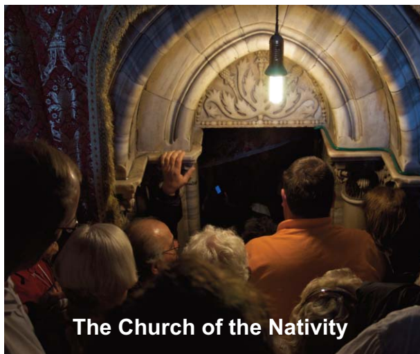
The Church of the Nativity

In Bethlehem, visit the cave revered as Jesus' birthplace and see the Church of the Nativity constructed over the site (Matt. 1:18-25). Pray in the Garden of Gethsemane and envision the scenes of the night before Jesus' crucifixion (Matt. 26:36 - 44). Outside of the modern city walls, visit the City of David and journey through time to see a portion of the Gihon Spring and the Pool of Siloam (John 9). Explore Hezekiah's Tunnel, an amazing engineering feat that was dug from either end and met in the middle! (Note: Those who are claustrophobic may want to meet the group at the other end of the tunnel!). Meditate on the events of the Last Supper as you visit the traditional location of the Upper Room (Mark 14:12). Return to the hotel for dinner and overnight.