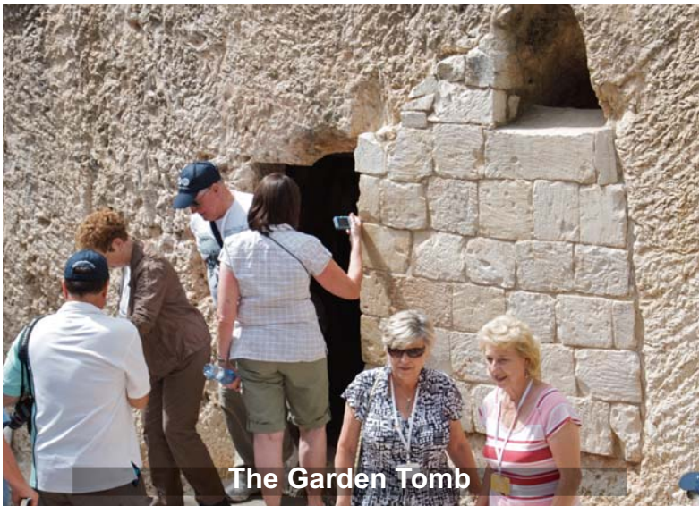
The Garden Tomb